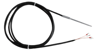
Lead wire type